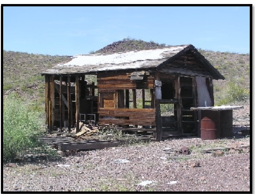
Continued on Page 6

We tried a day for metal detecting near Stanton and the ghost towns of Octave and Weaver. All we saw were no trespassing signs everywhere. Apparently they were not in a mood to share.