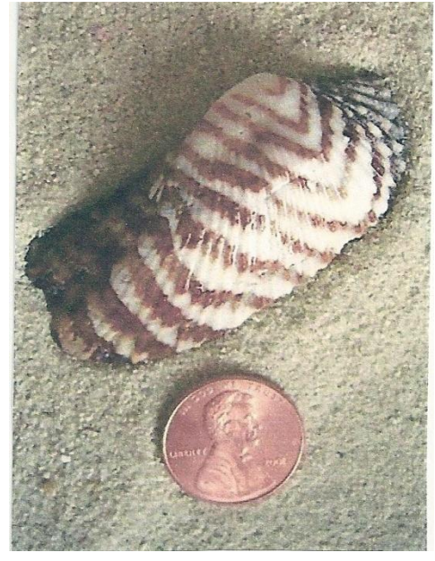
I finally got this picture in!!!

The highlight for Anne was having her picture taken in front of The Lady and Sons Restaurant. Shelling on beaches at Jekyll Island and Amelia Island, Florida were next on the list. The beach combing for shells is always a relaxing adventure. Many varieties were found for making into pedants between Melbourne and Vero Beach, Florida. The metal detecting for old Spanish coins around Sebastian Beach was enjoyable but unfulfilling monetary value. Why would anyone bury a beer can four feet down in the sand? After crossing the state we stayed in Fort Myers Florida for the night. The shelling on Sanibel Island was fun but very expensive. You are charged a fee when you arrive at the island and also by the hour to be on the beach.