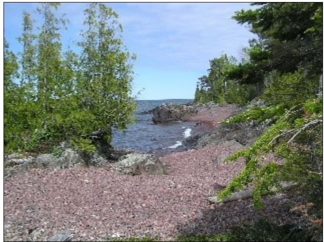
Superior shore line near Copper Harbor

Located just 4 1/2 miles north of Hancock, we stayed at the Arcadian Motel. Room #15 was our lucky number; with double beds, refrigerator and microwave oven. 3 1/2 miles away at Dollar Bay we found a good place to eat called Quincy's and a Marathon Gas station just a short distance away from where we ate. At this location many points of interest